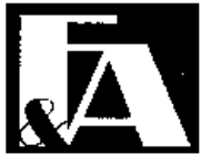
EXHIBIT "B" Fill Depth Summary